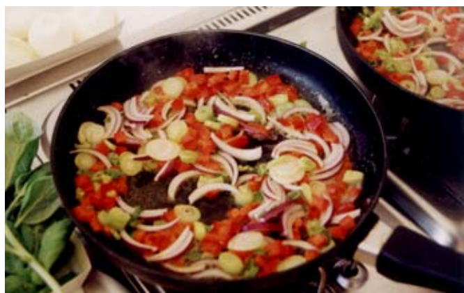
It doesn't have to be complicated to make it look good.