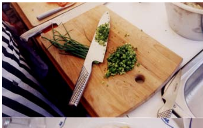
The art of chopping was demonstrated.