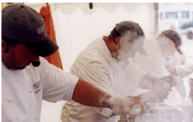
One minute left...