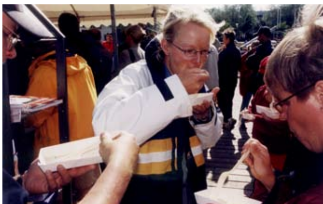
Of course everybody gets to taste what has been cooked.