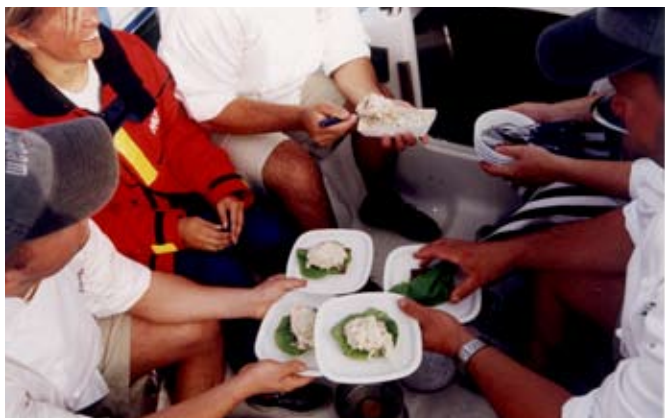
On board the winning boat in Mariehamn - an open J24 with camping burners only. But of course they got their 3 course dinner award...