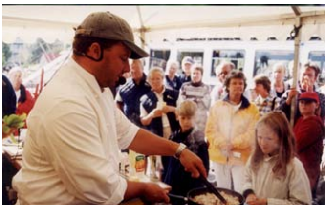
Stand up comedy cooking with something tasty for everybody...