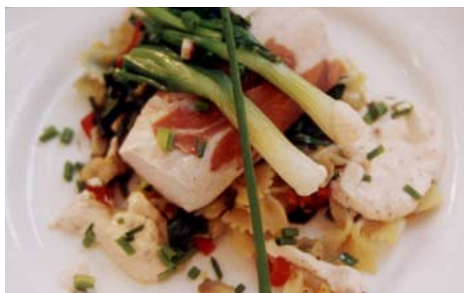
Easy cooking for small kitchens.