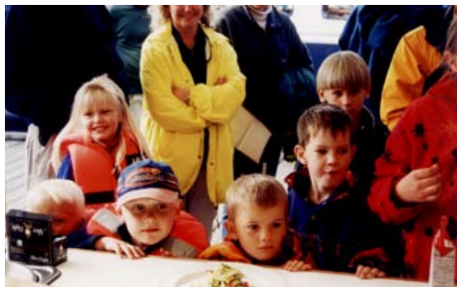
Chopped strawberries and Kesella with vanilla didn't look bad at all a day like this.