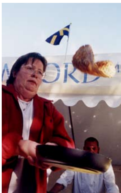
Lady in red competing in pan cake juggle...